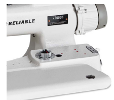
REMOVABLE SWING ARM