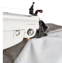
PLUNGER DROP FOR PRECISE STITCH DEPTH